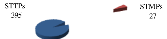
Fig. 1 Number of STTPs and STMPs Since Inception of the Pilot

This year, 49 projects were approved for CRP (i.e. funded). Of the 49 approved projects, 46 were STTPs and 3 were STMPs (see Appendix A). Since inception of the pilot, 422 projects were initiated (see Fig. 1). The total SBIR/STTR funding on CRP projects since inception of pilot is $421.4M and the total non-SBIR/STTR funding on CRP projects